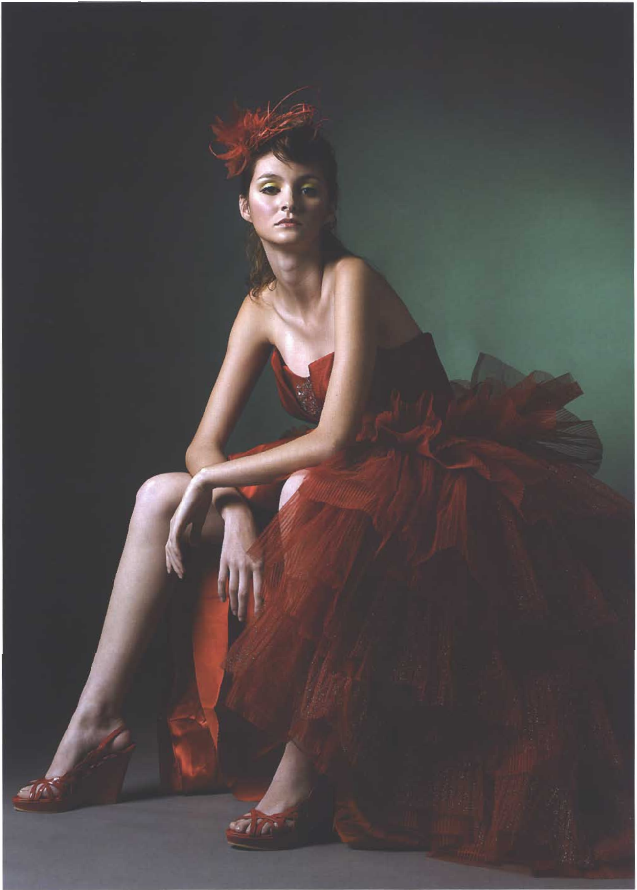
薇薇新娘 Sugar Red Princess Line Ruffles Dress. JustGracy Styling Red FurHead Dress. Hers Red Wedge Sandals.