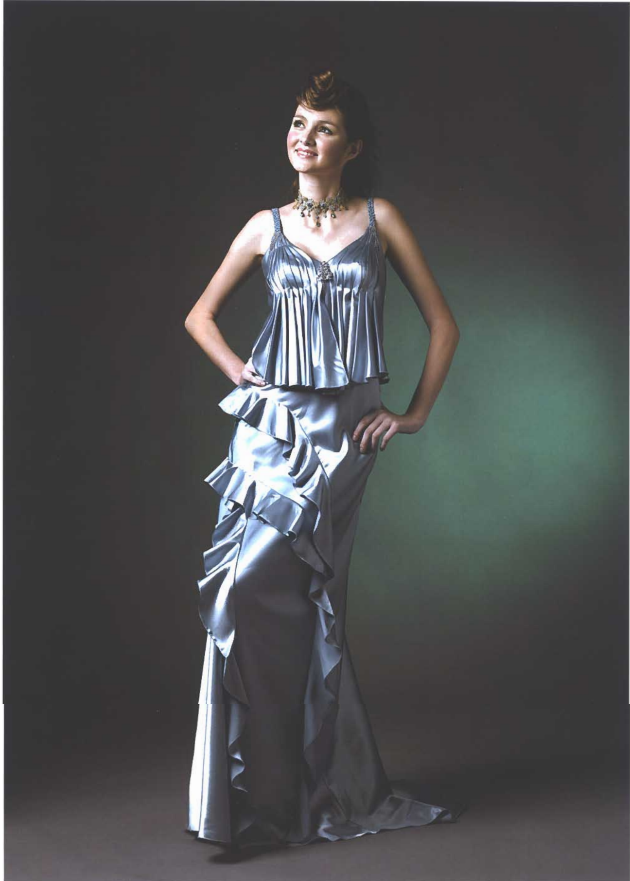
亞太麗緻 Silver Blue Two Pieces Dress. JustGracy Styling Necklace.