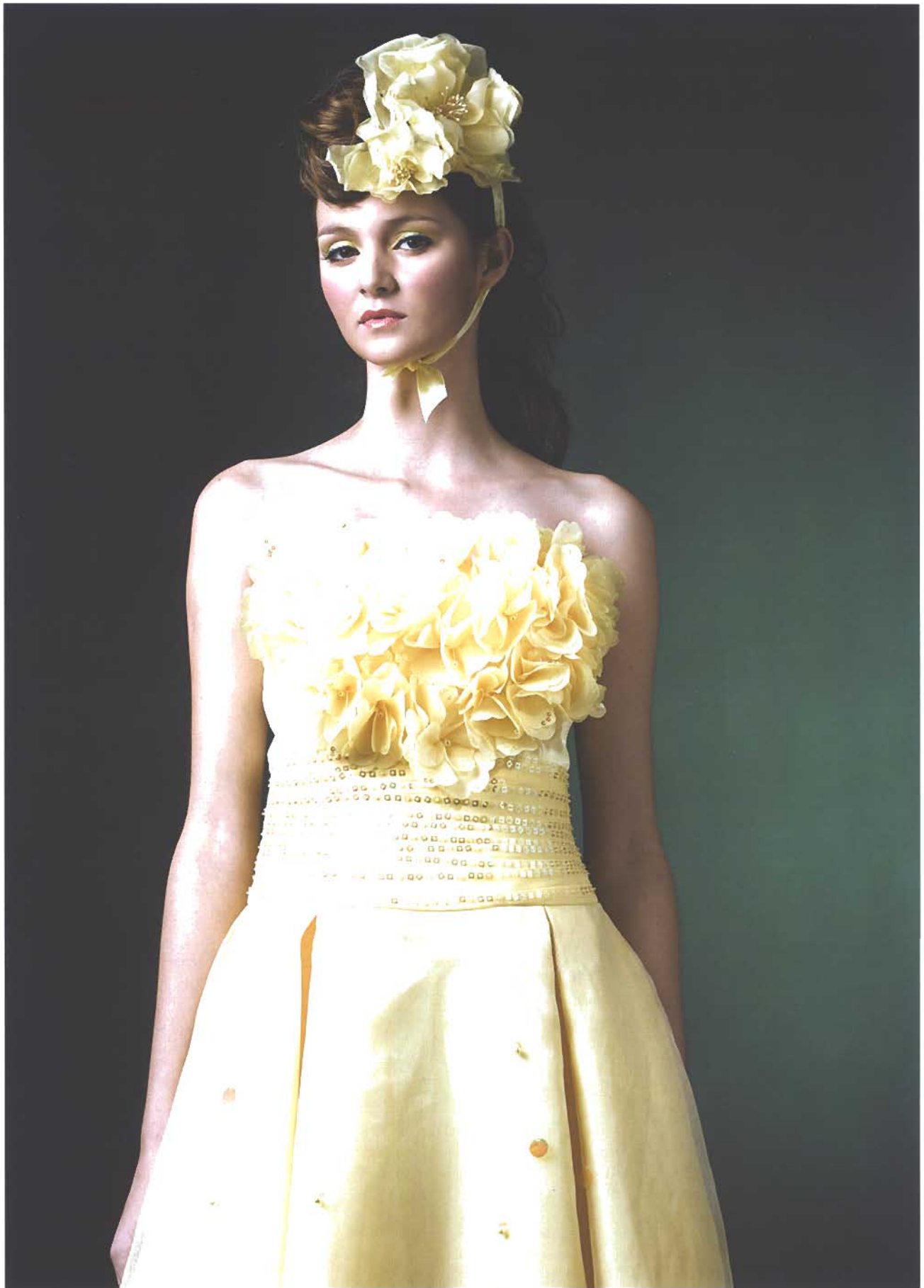
薇薇新娘 Yellow Dress with Low Cut Ruffles and Accessories