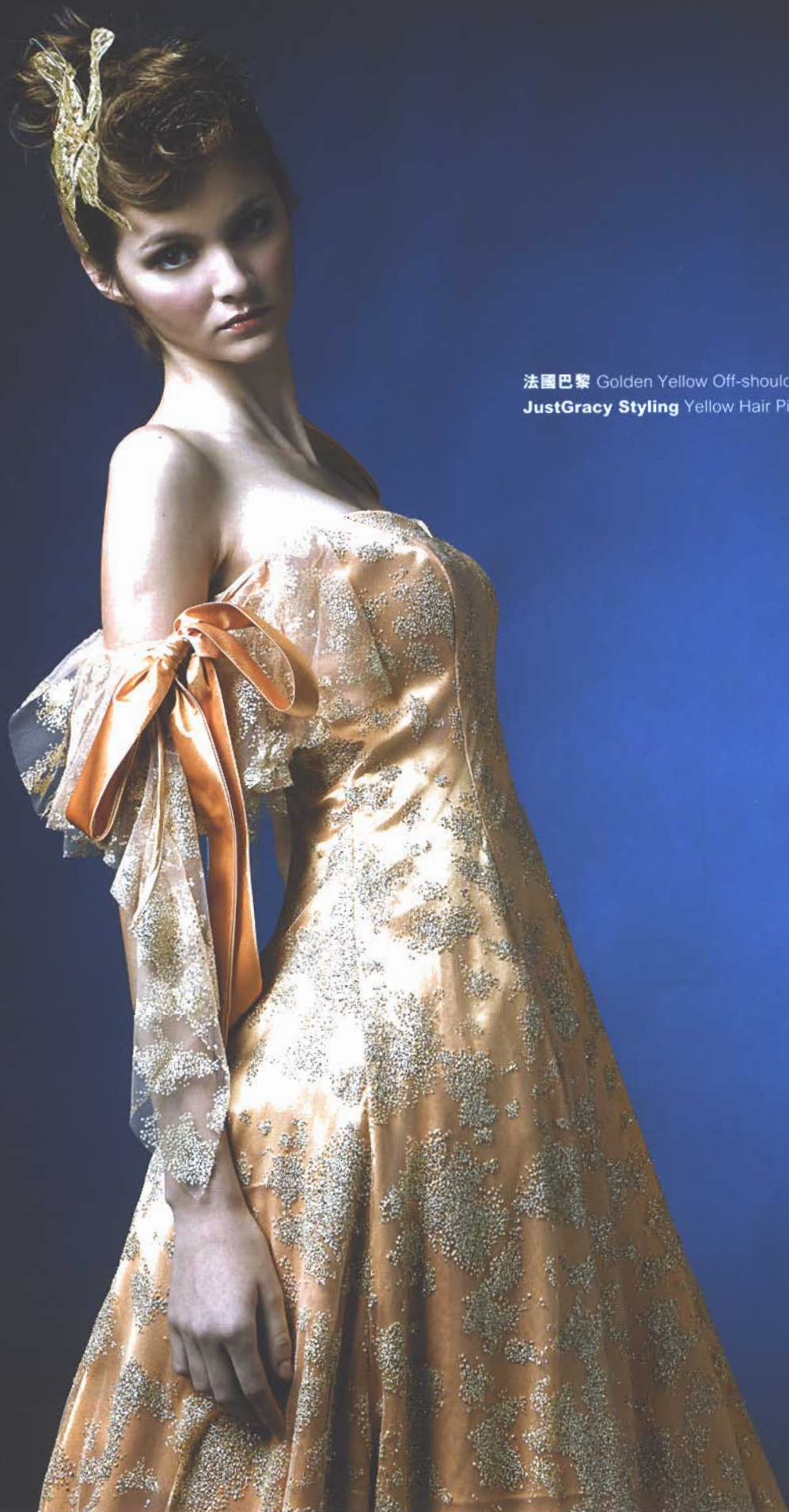
法國巴黎 Golden Yellow Off-shoulder Dress. JustGracy Styling Yellow Hair Piece.