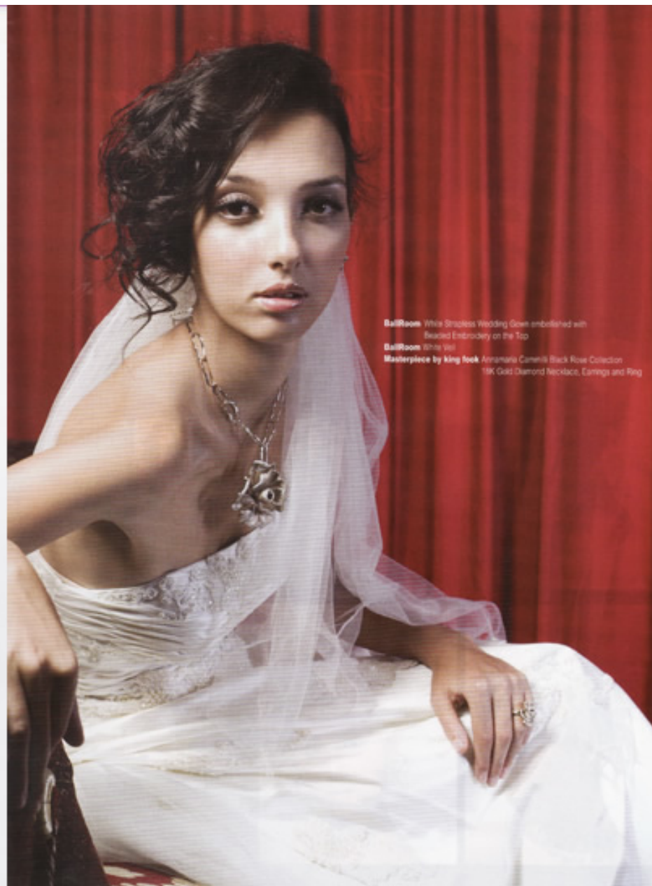
BallRoom White Strapless Wedding Gown embellished with Beaded Embroidery on the Top BallRoom White Veil Masterpiece by King Fook Arramaria Camellia Back Rose Collection 18K Gold Diamond Necklace, Earrings and Ring