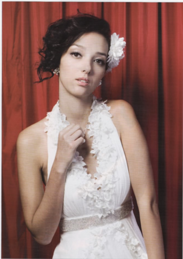
Peony Bridal Snowy White A-line Wedding Gown embellished with 3D Floral around neckline and Silver Waistband Peony Bridal Floral Headress Sauvignon Painted Beaded High Heels King Fook Jewellery 18K Gold South Sea Pearl Earrings, Necklace and Ring