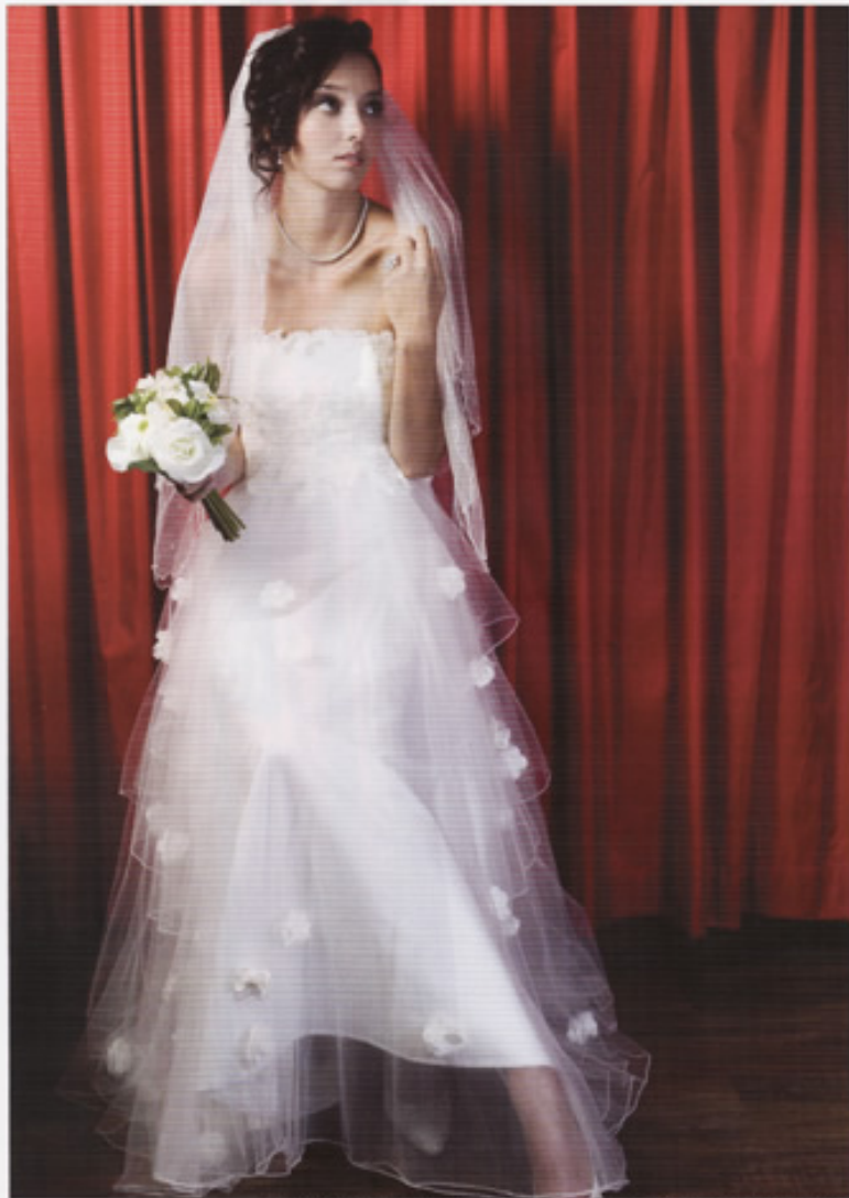
Peony Bridal Snowy White Strapless Wedding Gown with Flowery Lace on the Top and 3D Floral over the Bottom Peony Bridal White Veil at Waistline Sauvignon Pointed Beaded High-Heels King Fook Jewellery 18K Gold Diamond Necklace, Earrings and Ring Francfranc White Floral Decorations