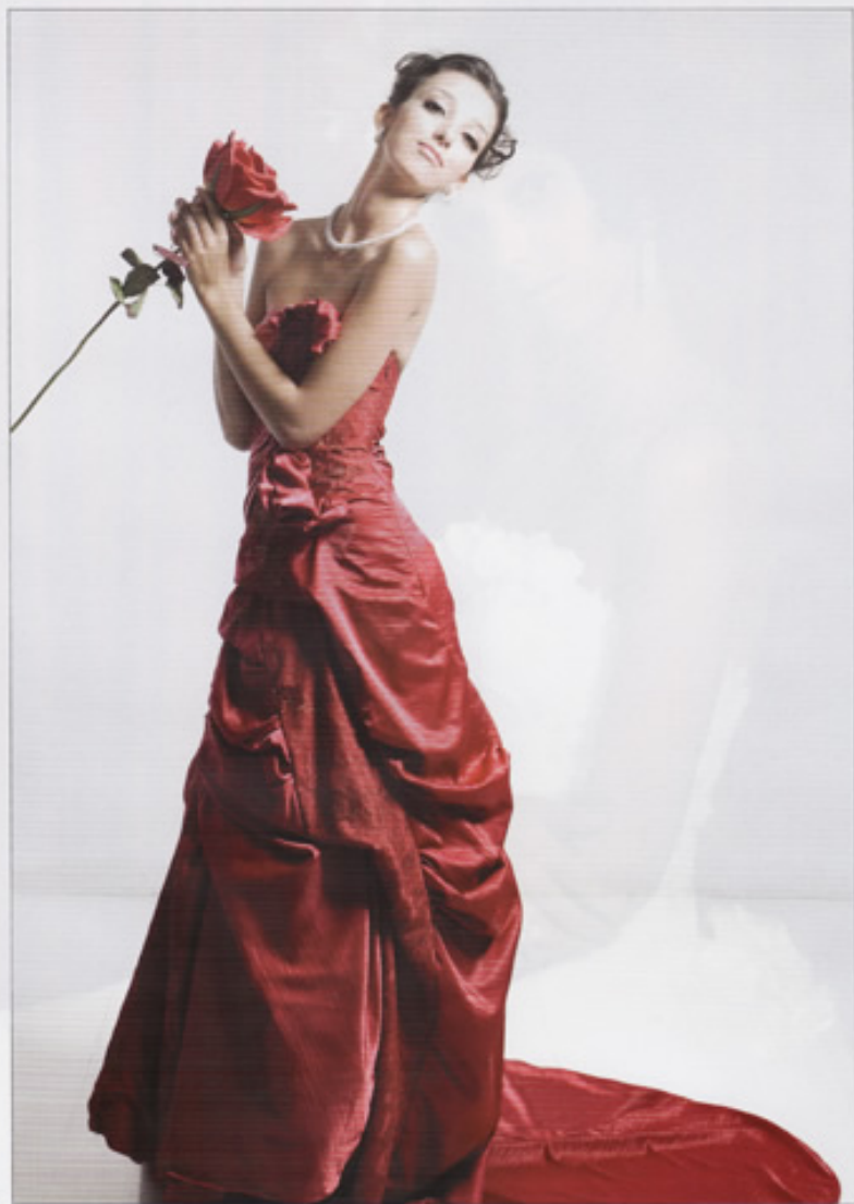
BallRoom Roy Red Evening Gown embellished with Red Embroidery along the Length, Slender Train Masterpiece by king fook 18K Gold Diamond Necklace, Earrings and Ring