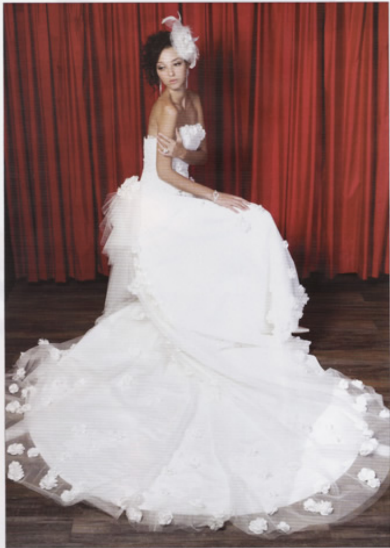
Peony Bridal White Wedding Gown embellished with 3D Floral Over All, 3D Floral Applique on the Back, Chapel Train Peony Bridal Floral Headress Sauvignon Pointed White High-heels Masterpiece by King Jook 18K Gold Diamond Earrings, Bracelet and Ring