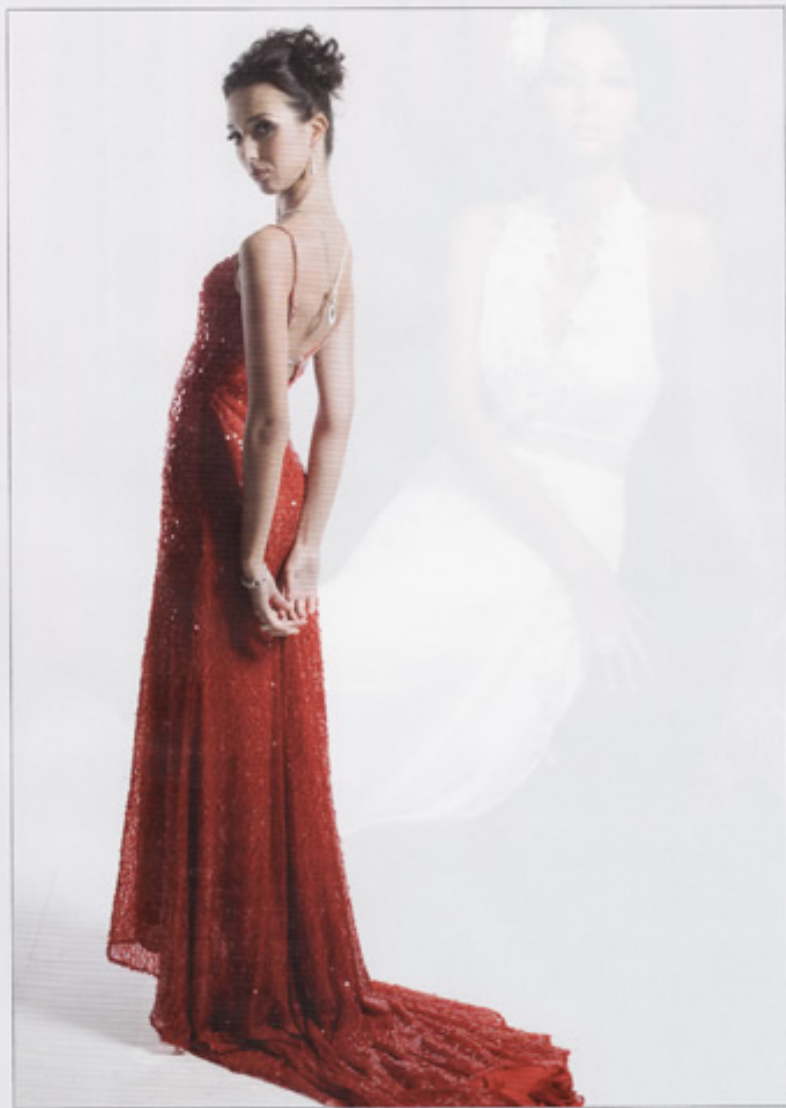
Butterfly Green Dazzling Red Sequined Evening Gown with Silvery Clasp on the Back Masterpiece by King Fook 18K Gold Diamond Earrings, Necklace, Bracelet and Ring