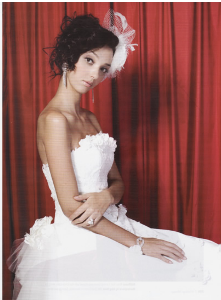
© 2011 Peony Bridal. All rights reserved. Peony Bridal is a registered trademark of Peony Bridal. All other trademarks are the property of their respective owners.