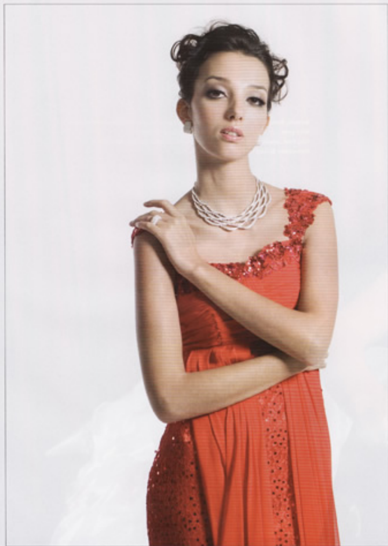
BallRoom Bright Red Evening Gown in A-line Design embellished with Beaded Floral on the Top and Sequins on the Bottom Sauvignon Red Evening High-heeled Sandals set with Swarovski Crystals Masterpiece by king look 18K Gold Diamond Necklace, Earrings and Ring